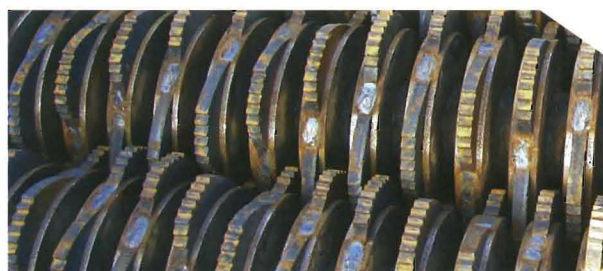
ADC Steel Disc Screen

Krause ADC Steel Disc Screens have the largest shaft and bearing size in the industry. These shouldered discs have hardened inserts, which provide long life and consistent hole size. They are built with a labyrinth seal to protect bearings from contamination.